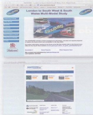
The multi-modal studies of the late 1990s/early 2000s produced "vast quantities of analysis" but didn't deliver much on the ground, says the DfT

The DfT questions whether investment in one mode can have a big impact on demand for another. "We need to be realistic about